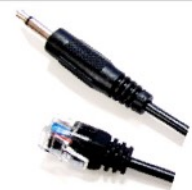
KM8, IM8, YM6